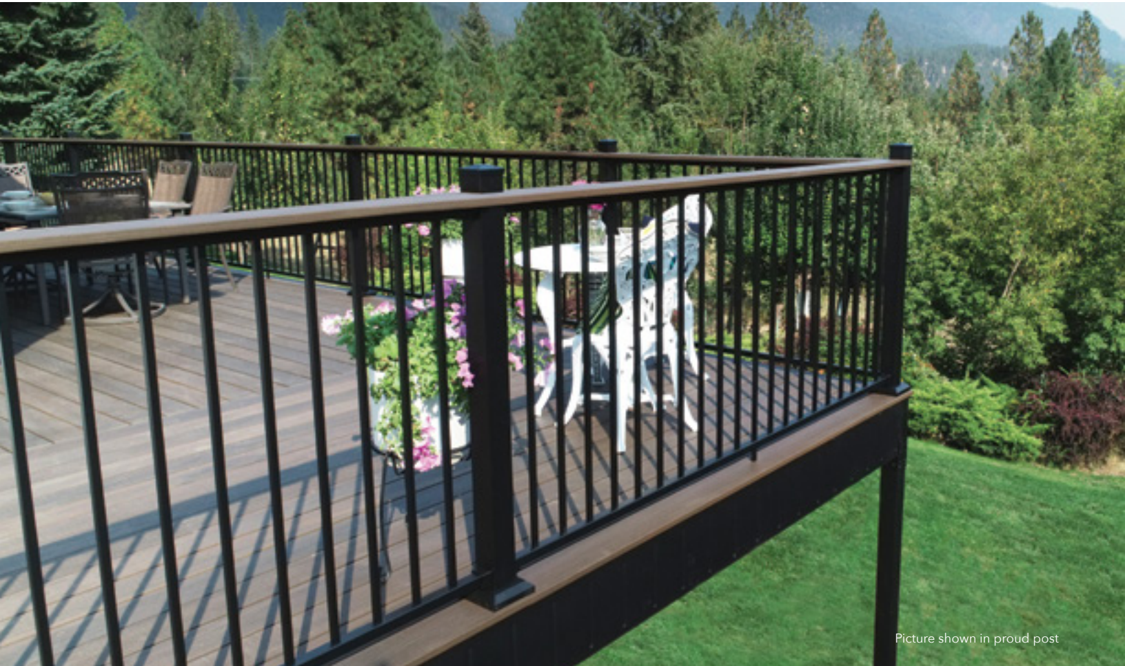
Picture shown in proud post

ITEM# 660368 (BLACK SAND) ITEM# 660364 (MATTE WHITE)